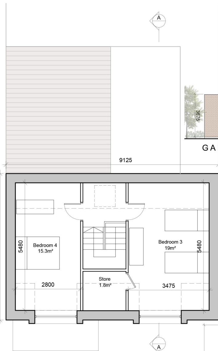
SECOND FLOOR PLAN AREA 45 SQM