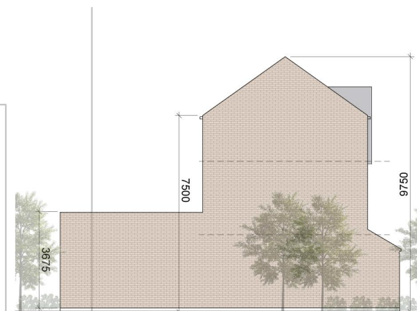
GABLE ELEVATION 1:200