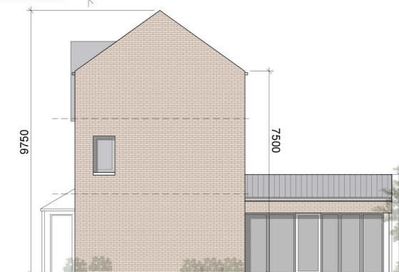
GABLE ELEVATION 1:200